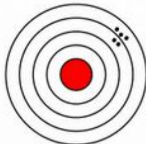
Not Accurate but Consistent