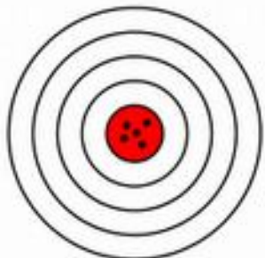
Accurate & Consistent