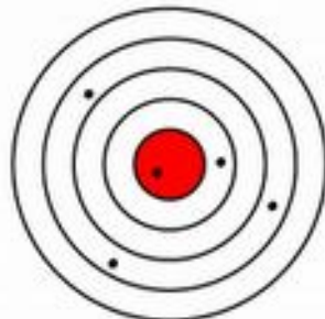
Not Accurate & Not Consistent

:weather1-7 a dcat:Dataset ; dct:title "Measurements from weather stations 1-7" ; dct:description "Data from seven weather stations showing temparture, humidity, wind direction and wind speed" ; dct:issued "2013-01-01T00:00:00+01:00" ; dct:modified "2013-07-01T19:20:30+01:00" ; dct:publisher <http://myweather.com/id/myweather> ; dcat:keyword "weather" ; dcat:landingpage <http://myweather.com/stations1-7.html> ; dcat:distribution :weatherdata1-xlsx . :weatherdata1-7-xlsx a dcat:Distribution ; dct:format <http://publications.europa.eu/resource/authority/file-type/XLSX> ; dct:licence <http://creativecommons.org/licenses/CC0> ; dcat:downloadURL <http://myweather.com/stations1-7.xlsx> .